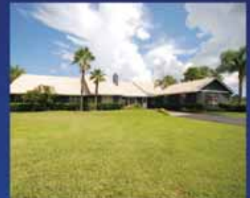
7+ Acres On Lake Fncd, paddock areas, gst hse - $1.250M