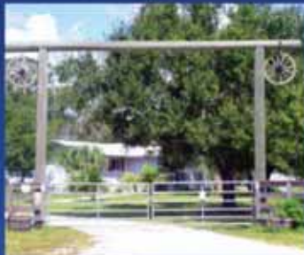
27 Acres Surrounded by Preserve Gst qrts, pole barn, 9-stall barn, fenced - $1.9M