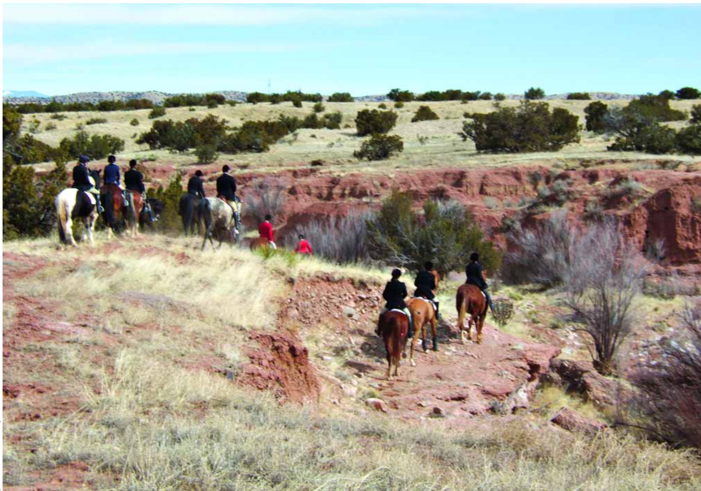
Hunting in New Mexico requires navigating rocky canyons.

“We rode 55 miles to get found after getting lost near the Sweetwater Station fixture in the red desert,” Phipps recalled. “For