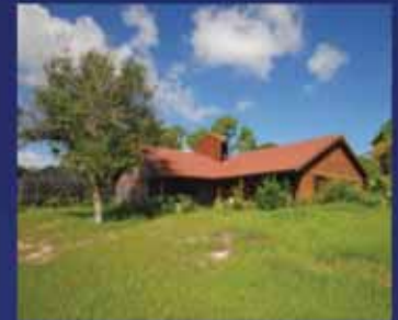
19.1 Acres in Jupiter Farms Pool, tennis crts, will sub-divide - $2.7M

22 acres, barn, lap pool, outdoor entert. area, pergola - $3,950,000