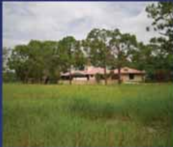
25 Acre Rustic Country Home Fenced, barn, lap pool - $2.750M

REGENTS exclusive affiliate of LEADING ESTATES L OF THE WORLD.COM